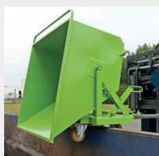
Emptying with forklift