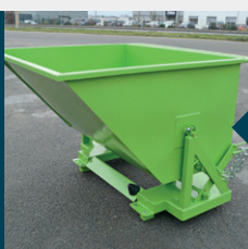
Version on base - ILP04000