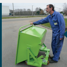
Easy emptying without forklift