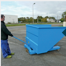
Castor-mounted model with drawbar