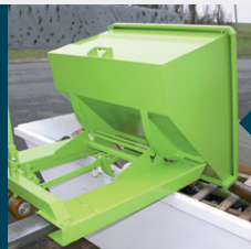
Automatic release on contact