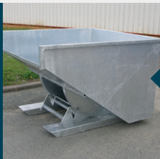
Galvanized pedestal-mounted model