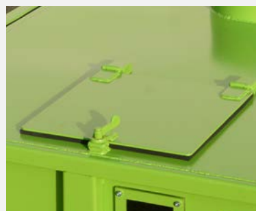
Leak proof inspection window (TEP) 300x300mm